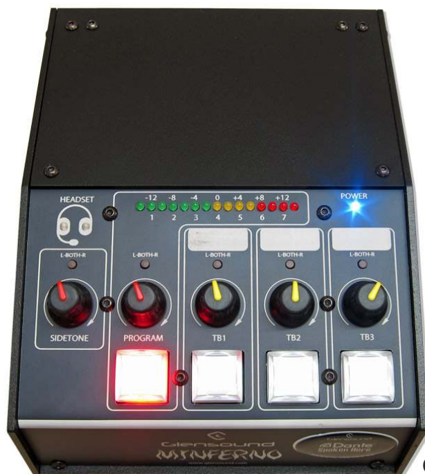
MinFerno Commentator's Box